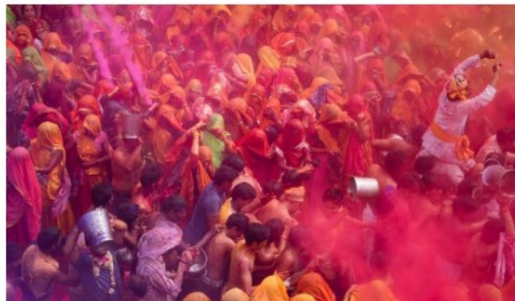
Holi celebrations in Northern India.

Hindus have fun by smearing each other with paint and throwing coloured water.